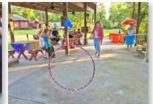
Elder Olympics games under the host's pavilion