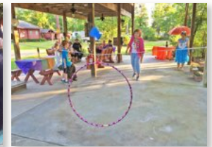
Elder Olympics games under the host's pavillon