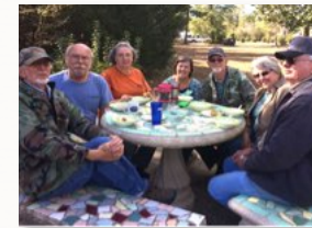
Relaxing with friends on a Mystic Springs workday