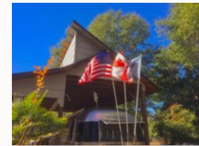
Camp host's flags on a beautiful Spring day

Temporary Airstream storage is $1.00 (in storage area) per day, $2 per day on a camp site (no hookups) with board approval of site. Neither the Park, the Unit nor it's Board of Directors or members are responsible for RVs in storage. Mystic Springs Cove, Inc. is not affiliated with the manufacturer of Airstream recreational vehicles, or the Wally Byam Caravan Club International (WBCCI).